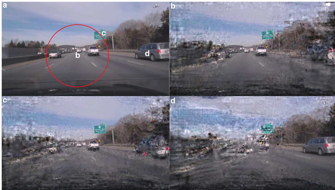
Fig. 3. Visualizing the information available in peripheral vision depending on fixation location. (a) An unmodified photograph of a highway scene near Boston, MA with an exit sign. The red circle around the letter b in the panel visualizes a 15° radial Useful Field of view. The letters b, c and d overlaid on the image indicate different fixation locations used for the visualizations in subsequent panels. (b) Photograph from (a), with the point of fixation on the forward roadway ahead of the vehicle, after being processed through the Texture Tiling model to visualize how peripheral information might be represented. Notice the degree to which the scene remains generally recognizable, and how the visualization changes with increased eccentricity from the leading vehicle. Also, note that the region corresponding to the Useful Field (as shown in (a)) is not left inviolate by this transformation. In particular, the exit sign remains recognizable, and the positions of other vehicles remains fairly stable, although some details are lost. (c) Photograph from (a), visualized with the point of fixation on the exit sign; notice that vehicles in the left lane are somewhat obscured, but detectable. There are considerable cues for lane-keeping, including the left road edge, which lies far from the point of gaze. (d) Photograph from (a), visualized with the point of fixation on the van in the far right lane. The exit sign is still visible, but the left lanes of travel are nearly unrecognizable, predicting suboptimal performance localizing nearby vehicles. (For interpretation of the references to colour in this figure legend, the reader is referred to the web version of this article.)

(Helmholtz, 1898, translated 1924; James, 1890)). The presumed role of attention in vision (and what, in vision, can be accomplished without it), has evolved as a result of over a century of research (see Carrasco, 2011) for a modern review of recent work).